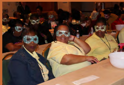
Pamper Party - Eye Gel Masks