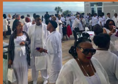
White Party at the Beach