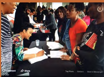
Book Signing at CBLR