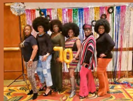
70s Party at the CBLR