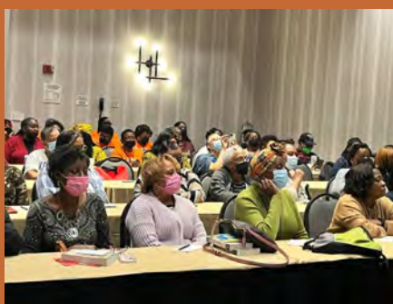
Workshops at CBLR