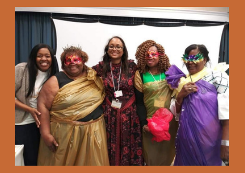
Having fun at the book fair