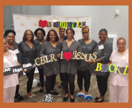
Readers Getting Books Signed